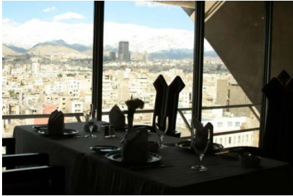
Tehran Hotel Laleh

At Magic Carpet we carefully select the best available hotels, according to location and charm in the areas visited. However it is worth noting that the standard in Iran is not yet comparable to Western Hotels. Below is a selection of some of the hotels we use on our tours.