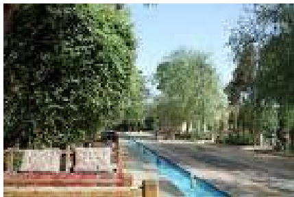
Yazd Moshir or Mehr Hotel