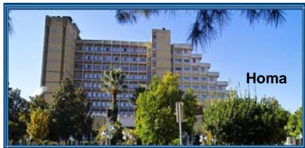
Shiraz Homa or Pars Hotel